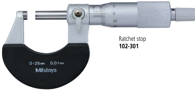
Ratchet stop 102-301